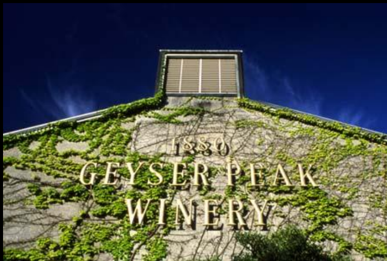
Geyser Peak Winery

Located in the Alexander Valley in Sonoma County, California the Geyser Peak Winery was established in 1880. Perched on a hillside across from Geyser Peak Mountain, the winery overlooks Geyserville, the Russian River and the northern end of the Alexander Valley. Consistently winning some of the most prestigious awards in winemaking, including Winery of the Year and Winemaker of the Year honors. Geyser Peak varietals compare favorably to wines costing many times more. Geyser Peak